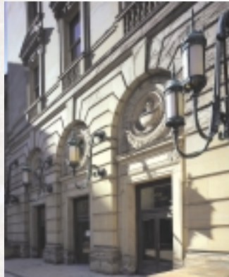
Cleveland Municipal Schools

The Ohio Educational Credit Union is very proud of its financial strength and stability. Throughout our 70-year history, we have reported consistent growth in capital, membership and services. The membership represents several diverse professions, with education being the most significant.