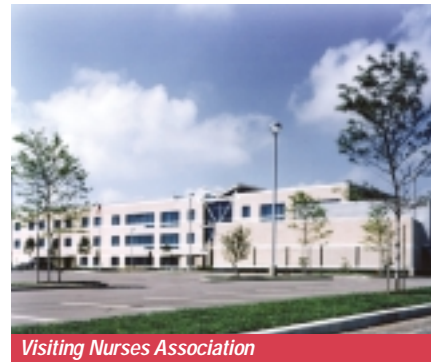
Visiting Nurses Association