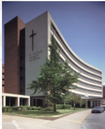
St. Vincent Charity Hospital